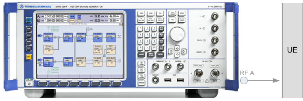
Fig. 1-1: Test Setup